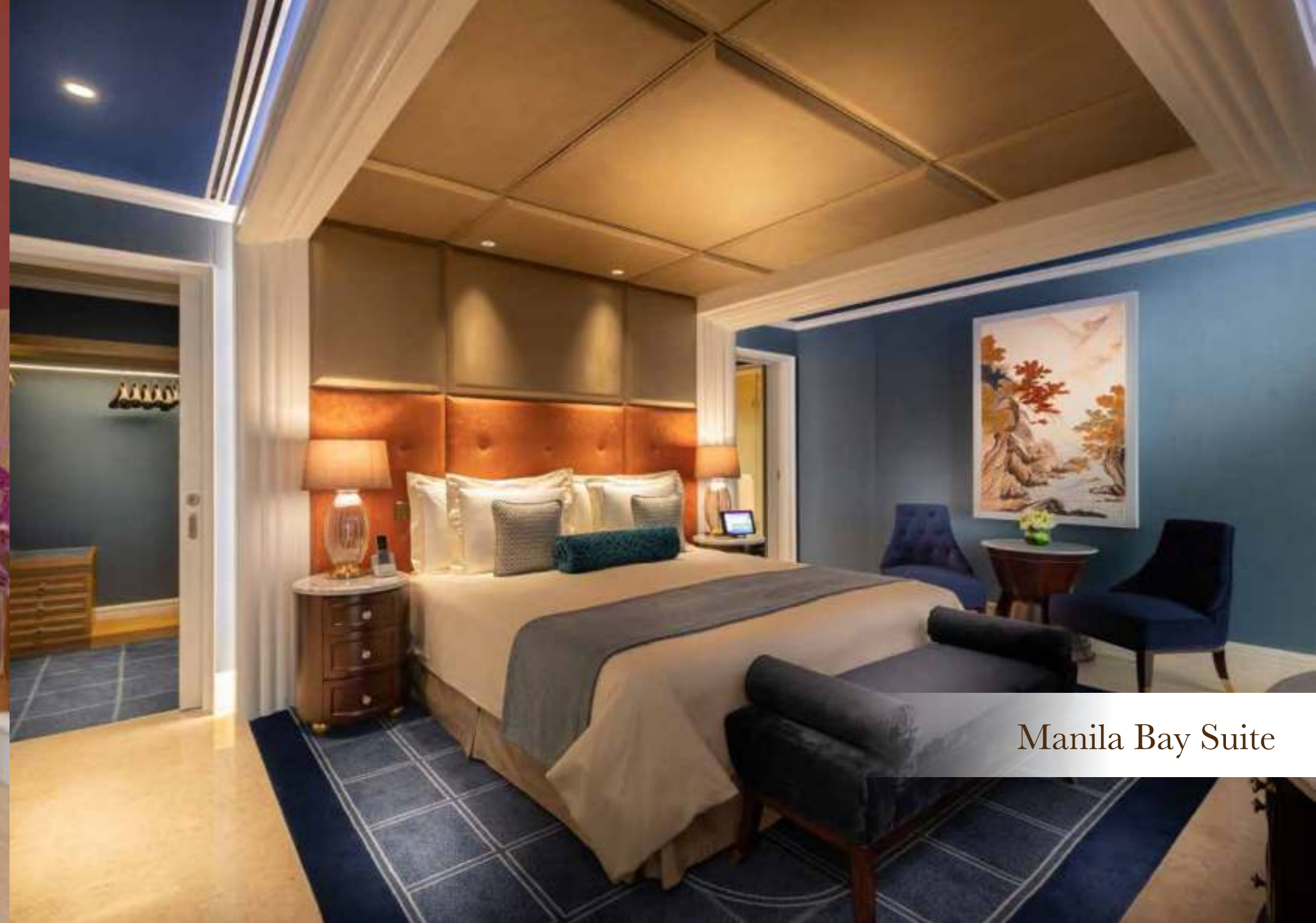
Manila Bay Suite