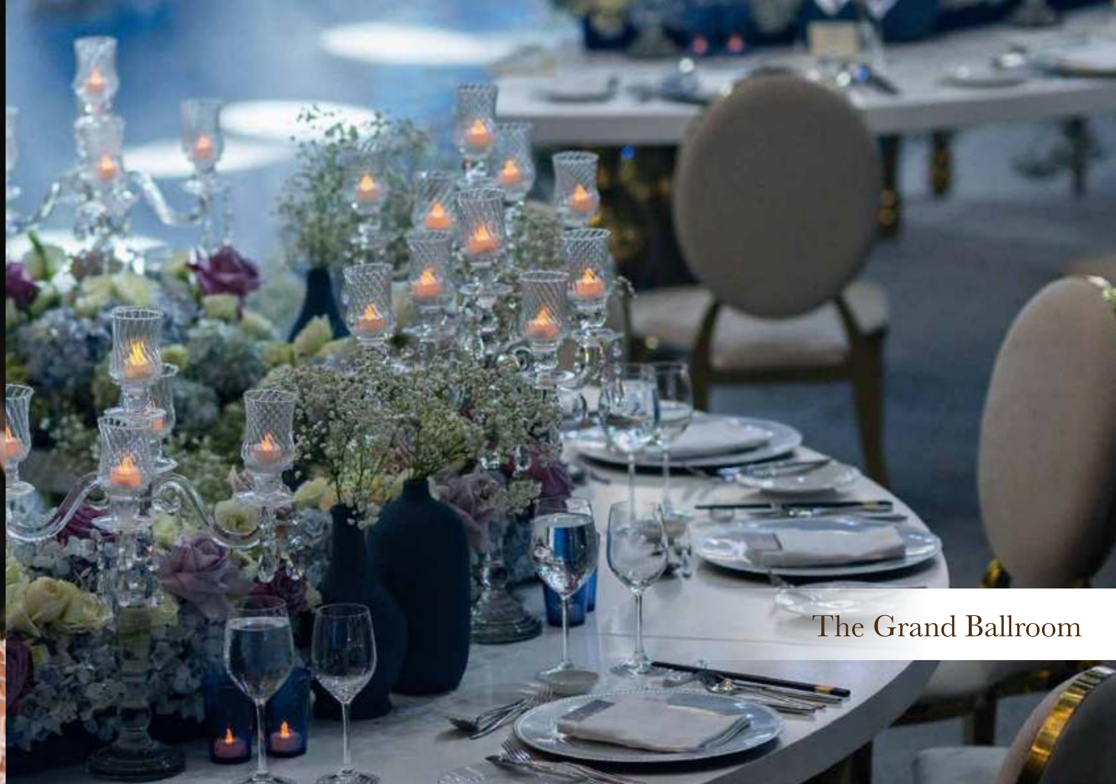
The Grand Ballroom