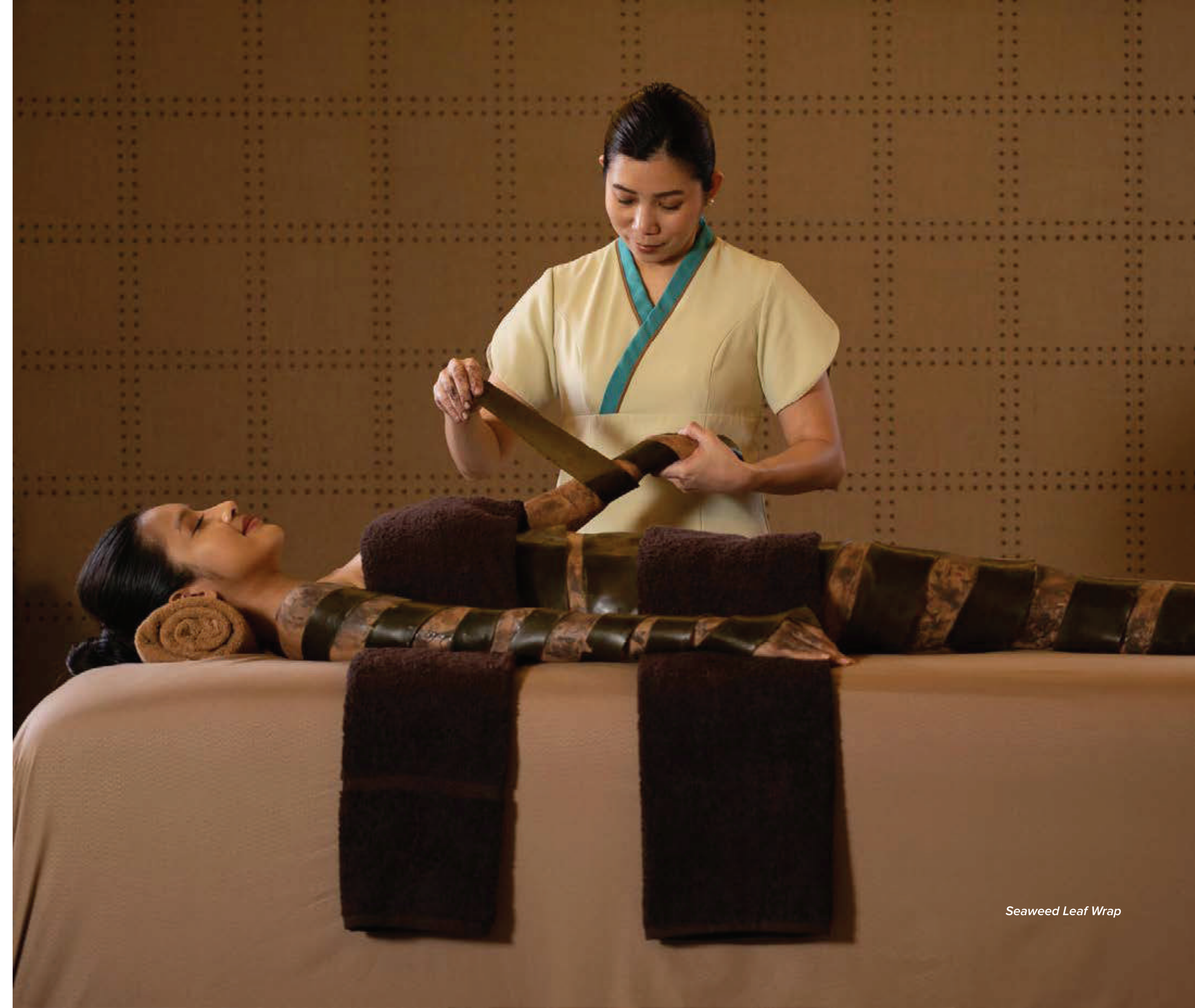
Seaweed Leaf Wrap