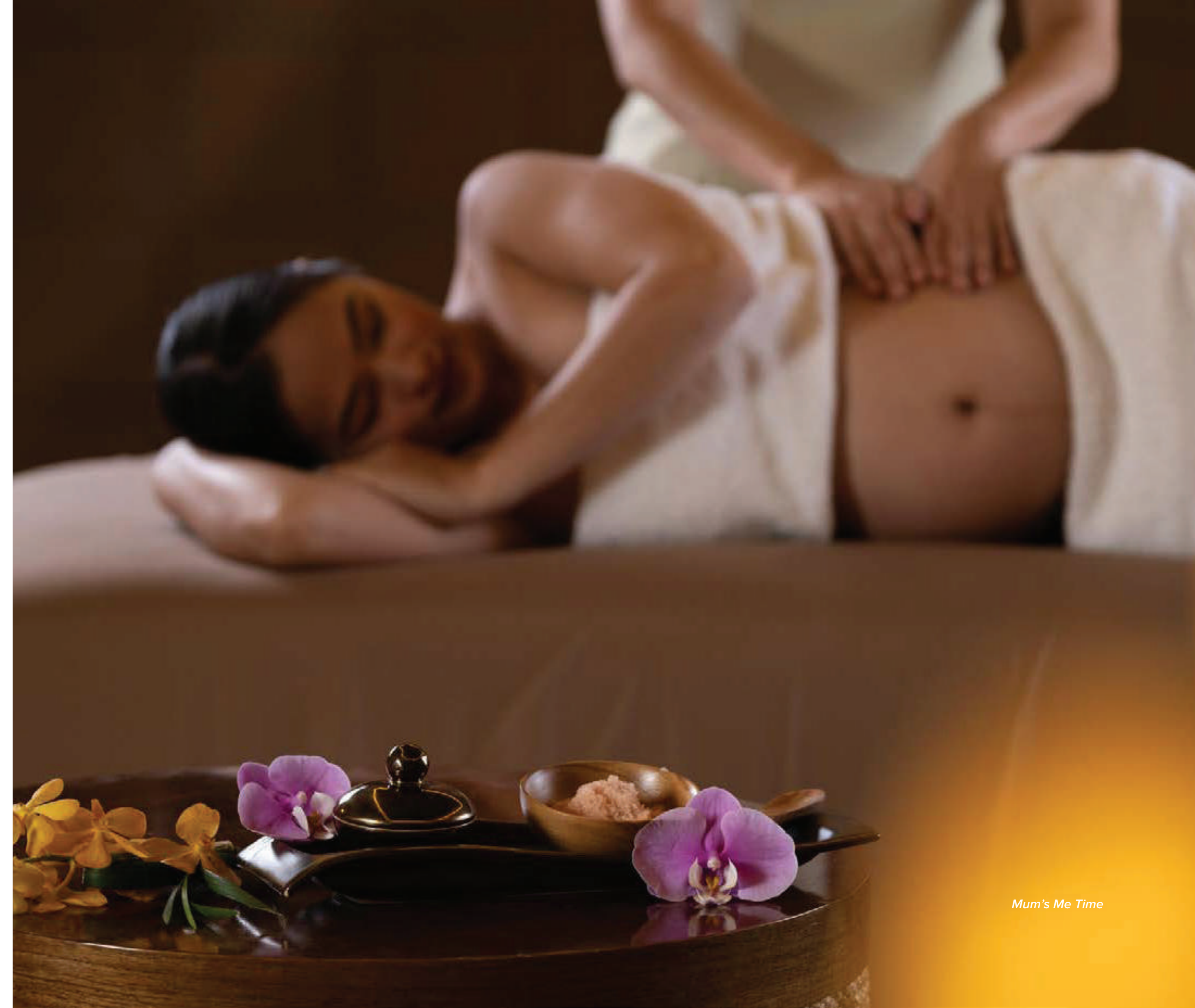
Mum's Me Time

* Recommended for those who need a soothing, grounding treatment that provides relief from exhaustion, stress, and chronic fatigue.