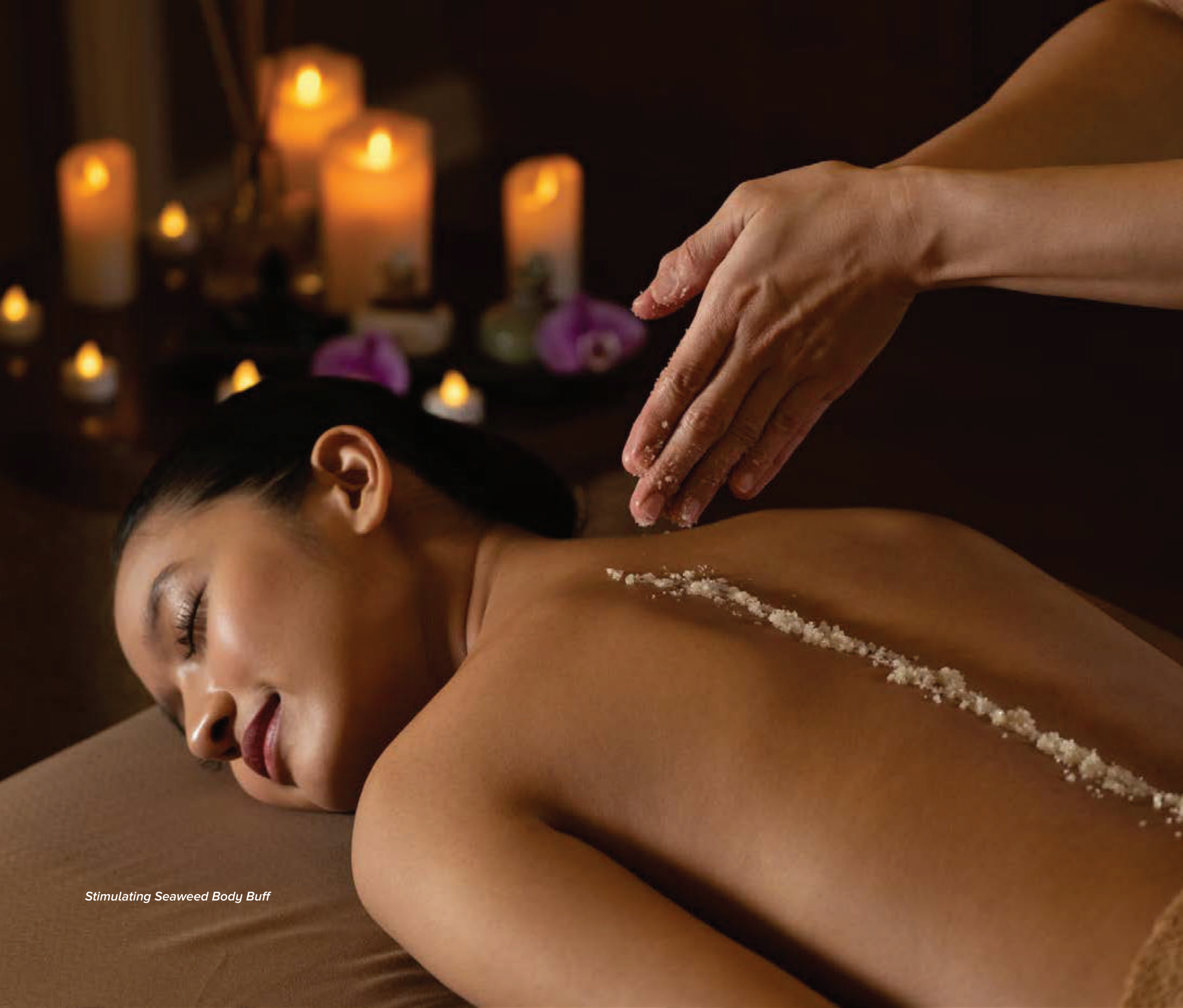
Stimulating Seaweed Body Buff