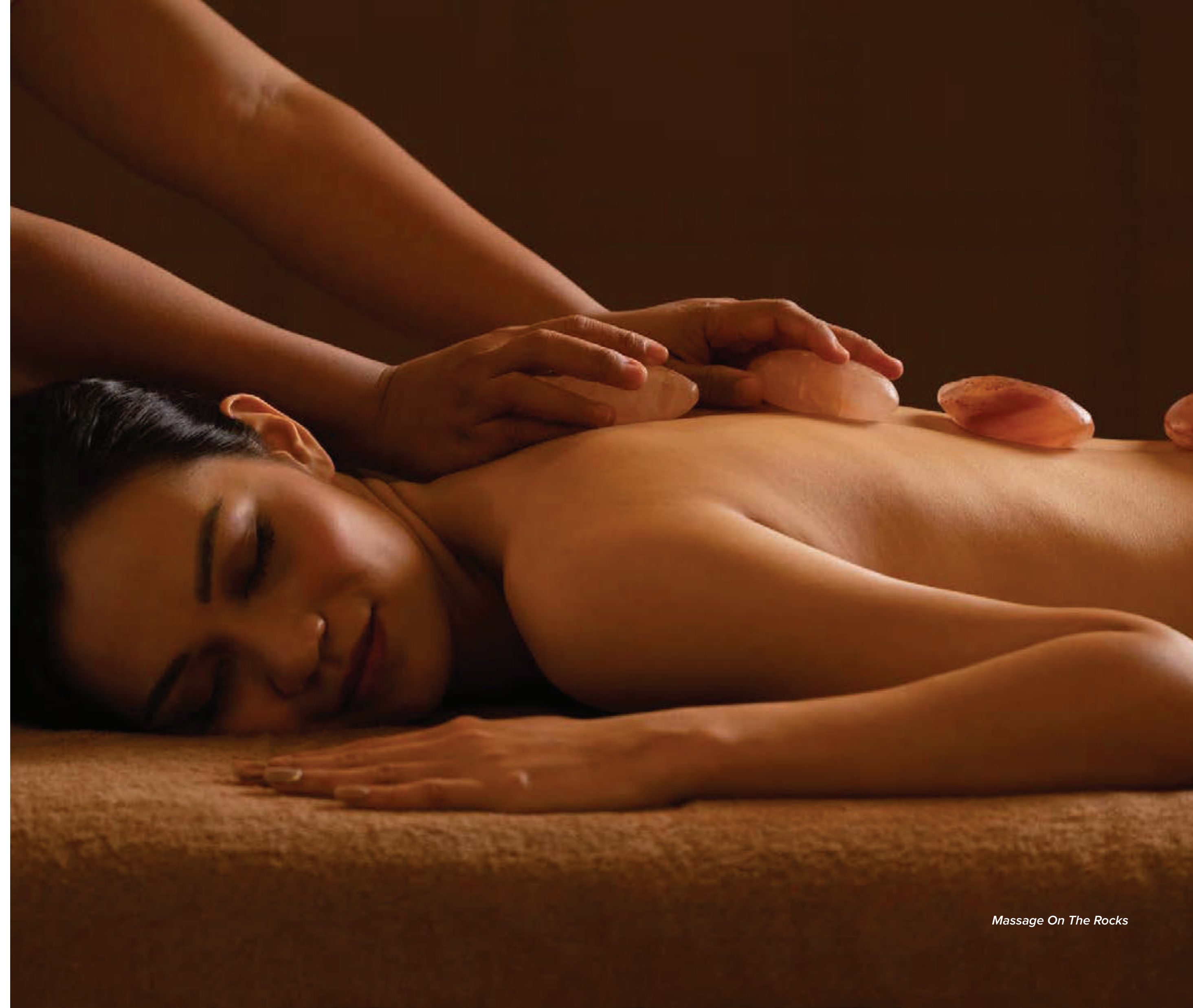
Massage On The Rocks